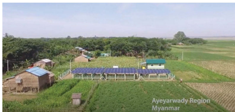
Lighting the Way for Growth in Rural Myanmar—Agriculture.

programs of its kind. Lessons learned have been shared with countries from the region, such as Bangladesh and Pakistan, and beyond in Sub-Saharan Africa.