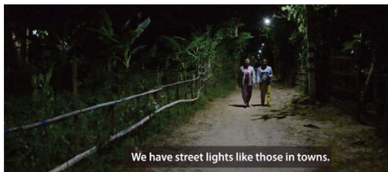
Lighting the Way for Growth in Rural Myanmar—Agriculture.

So far, 85 mini grids have been approved, mostly solar. Of these, 37 are already operational—developed by local and international entrepreneurs—providing 24-hour reliable electricity to rural households, enabling income-generating activities, clean water provision, improved health and education services, and street lighting. Women are benefitting from better social services, increased safety, improved communication, and new entrepreneurship opportunities. In the context of Covid-19 pandemic, the mini grid developers engaged local communities in the distribution of soap, protective equipment, and hand sanitizer, while also providing tariff discounts and donations. Displacing polluting diesel generators, these mini grids have also contributed to a reduction of greenhouse gas emissions by 93.9 kTC carbon dioxide equivalent.